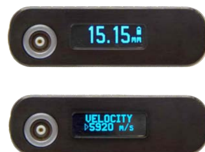
New Bright and Clear Organic LED Display

With multiple echo, readings are taken by measuring the time delay between any three consecutive backwall echoes. The time of T1 (including coating thickness) is ignored. The times of T2 and T3 are equal to the time that it takes to travel through the metal. Only by looking at three echoes can the measurements be automatically verified (where T2 = T3 ).